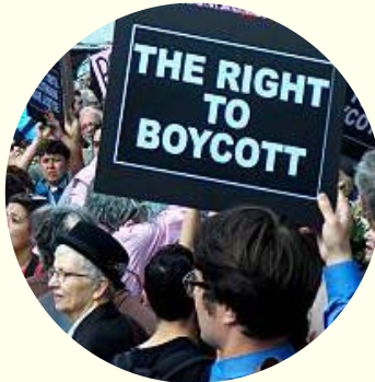
It is up to us to harness our cultural and economic power to hold anti-democratic actors accountable.