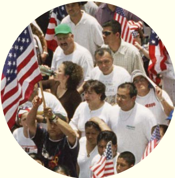
It is up to us to make our voices heard.

In this moment , when so much that we care about throughout American society is under attack, including the legal profession itself, it is up to us to take a stand for the Rule of Law.