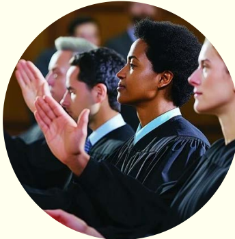
It is up to us to use our moral authority to mobilize the broader population to protect our democracy.